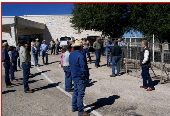
Discussing hog trap construction at Ranching In 21 st Century Workshop.

Educational workshop offered October 26. Topics for traditional ranchers and new landowners included: Trends in Ag Land Use, EQIP & Water District Updates, Harvesting Mesquite For Biofuels, Native & Exotic Wildlife Interaction, Designing Feral Hog Traps, Pesticide Laws & Regulations, and Livestock Risk Protection & Drought Insurance.