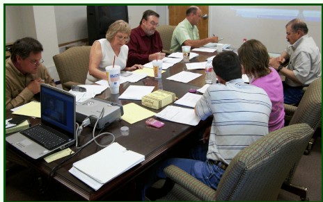
Pesticide applicator training.

Annually this training is offered to provide training and certification for those needing pesticide applicator licenses in order to purchase and apply restricted-use pesticides. These include city or county staff and land managers.