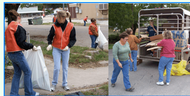
Youth taking part in city cleanup; recycle day.

Youth are provided learning opportunities through club work, project activities, and community service. There is also curriculum enrichment in partnership with local schools. The following projects are active: Hunter Education Veterinary Science Range Evaluation Wool & Mohair Judging Food & Nutrition Clothing & Textiles Method Demonstrations/ Illustrated Talks Citizenship Curriculum Enrichment