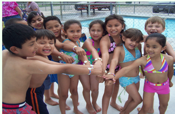
“Sun Safety Day” Youth Showing Off UV Bracelets

Throughout 2007 Extension partnered with the local hospital and wellness center staff and held educational events on all three school campuses. In March the group held a “Kick Butts Day” in which 500 youth learned about cancer prevention and the dangers of tobacco. In a separate program in May some 360 elementary were treated to a “Water and Sun Safety Week.” Grades pre-K - 4 th grade learned about water safety and the importance of protecting their skin from the sun’s harmful rays.