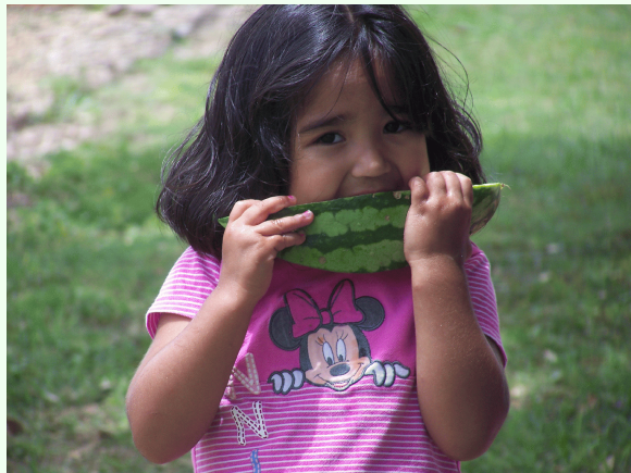
Headstart 5 A Day Program

Through the “Better Living for Texas Program” Extension offered monthly programming to youth, young families and senior citizens. 430 residents learned how to choose foods that are inexpensive and good to eat, how to make your food dollars last longer and learned what food labels mean and how to use them to choose good foods at the grocery store.