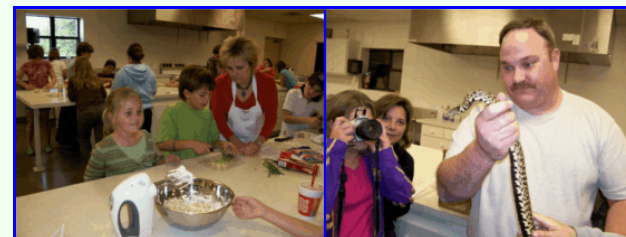
Food & Nutrition/Photography & Wildlife Projects.

Involvement helps to develop skills and provides new knowledge. Traditional projects such as sheep/goats are offered in addition to new projects such as Photography and Wildlife (P.A.W.S).