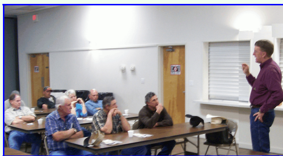
Ranch Disaster Preparedness Workshop.

The preparedness workshops took place on March 21 st and April 19 th . The first program dealt with topics such as drought, wildfire, and theft. The second workshop centered on animal disease.