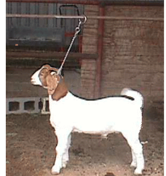
Using headracks or tying the animal can help teach it to stand correctly.

The next step in the training process is for the exhibitor to lead the animal (without a halter for lambs) and properly set him up. Set the hind legs up first, then place the front legs, keeping the body and neck straight and the head in a high, proud position with ears up and forward.