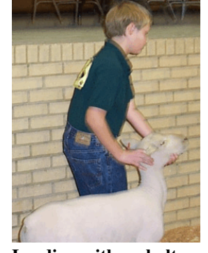
Leading with no halter.