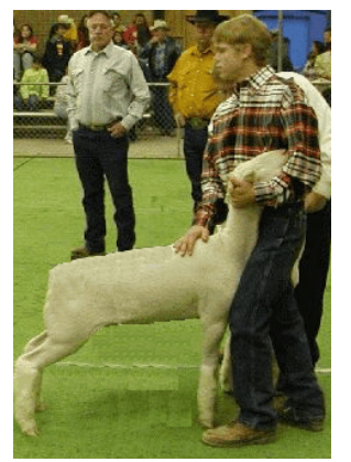
Showing the lamb.