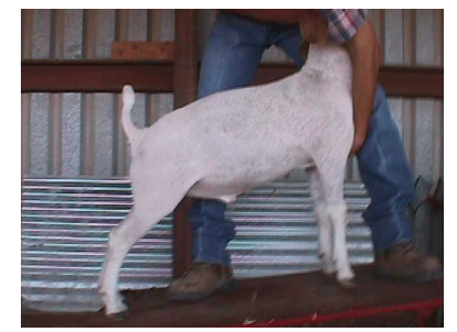
Setting up feet & legs.

Last, but not least, is bracing. The animal should learn to lead, set and remain set-up while the exhibitor moves around him. Then it is ready to be taught to brace or push. A lamb must push or brace himself when the judge is handling him. Most exhibitors are also bracing their goats. Lambs and goats can be taught to push by placing them on a trimming table or other platform with their rear feet near the edge. Position the legs and then gently push the animal