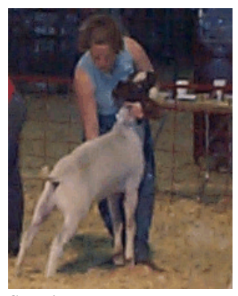
Showing the goat.