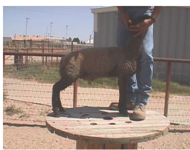
Teaching to brace.

Call your Sutton County Extension Office at: 387-3101 for help or additional information.