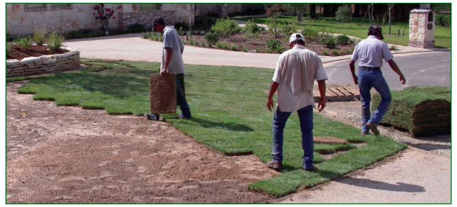
Figure 4. Sod installation.

Sodding. The firm soil surface should be free of footprints, stones, depressions and mounds. Sod is perishable and should be installed within 36 hours of harvest. If you see mildew or yellow grass leaves as you pull the pieces off the pallet, it is evidence of “sod heating” injury, which happens when sod is left on the pallet too long. Do not plant such sod.