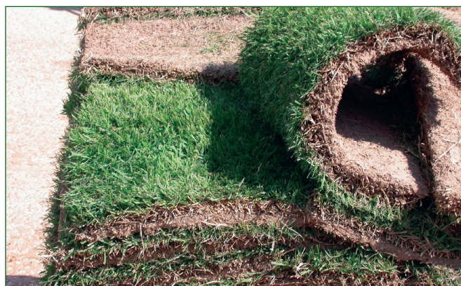
Figure 2. Sod pieces stacked on a pallet awaiting installation.

Sod has traditionally been sold by the square yard, though the trend now is to sell it by the square foot. To determine the amount of sod you will need, measure the square feet of the area to be planted, then divide the total square feet by 9 (the number of square feet in a square yard) to calculate square yards. There are 111 square yards per 1,000 square